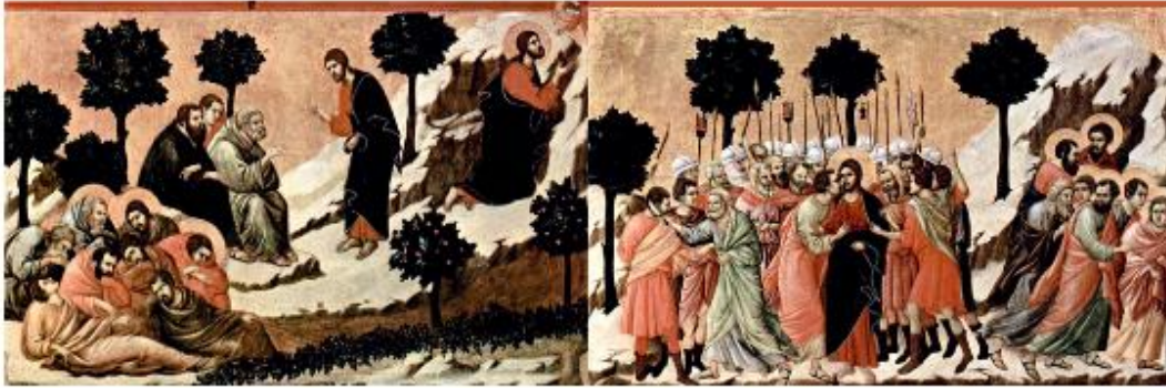
Duccio, di Buoninsegna, -1319?. Agony in the Garden (left); Arrest of Jesus (right), Panel from the Maesta Altarpiece of Siena